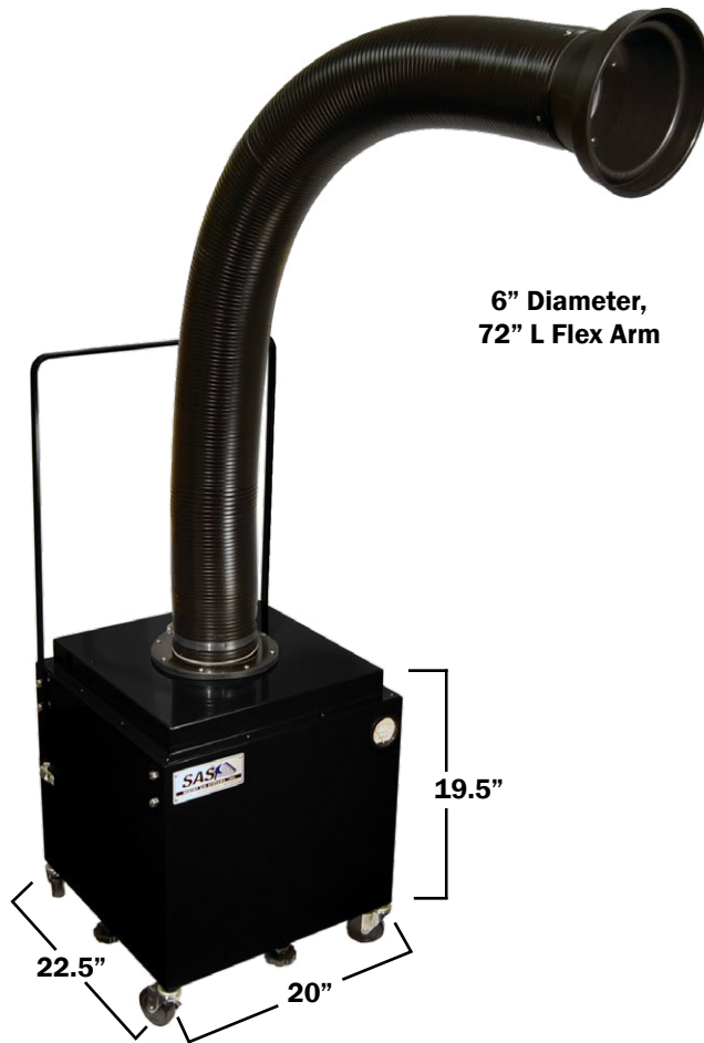
6" Diameter, 72" L Flex Arm

Dimensions are approximate Shown with optional accessories